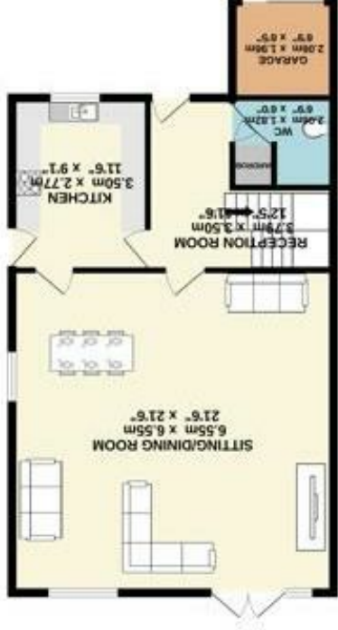
GROUND FLOOR (753 sq ft) approx.