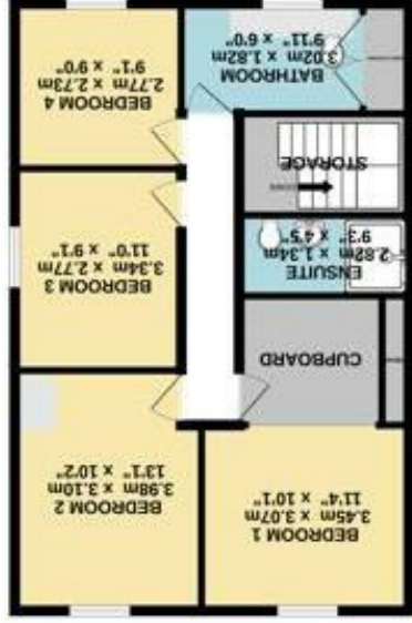
1ST FLOOR (663 sq ft) approx.